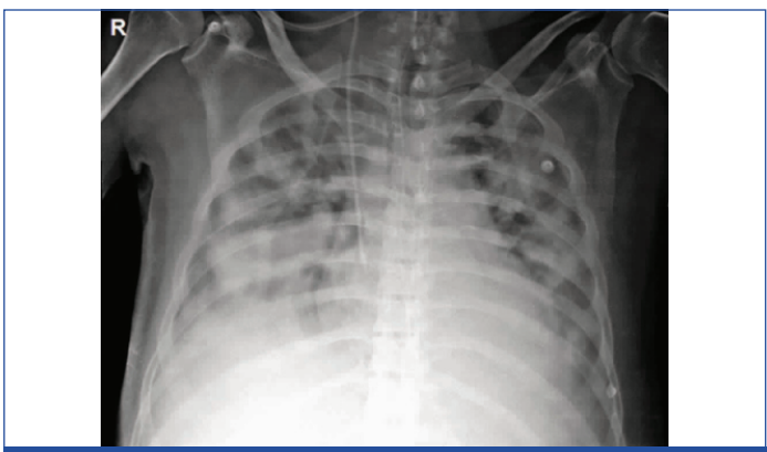
[Table/Fig-1]: X-ray chest showing bilateral lung infiltrations on admission.

As he was dyspneic and hypoxic, he was intubated and mechanically ventilated. On 4<sup>th</sup> day he had right sided pneumothorax and Intercostal Drainage (ICD) was placed, chest expanded [Table/Fig-2]. After 24 hours there was right-sided tube block and another ICD was placed. Repeat X-ray chest showed expanded right lung.