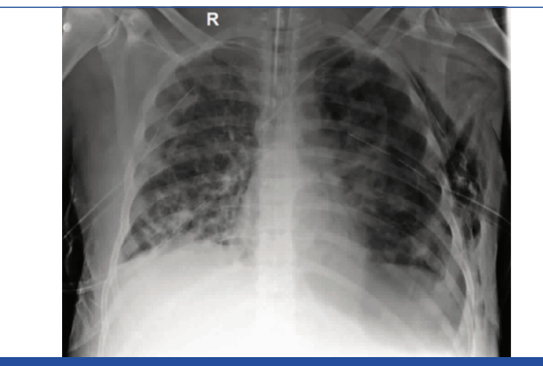
[Table/Fig-3]: X-ray chest showing right sided expanded lung with left sided pneumothorax with Intercostal drainage, bilateral pulmonary nodules